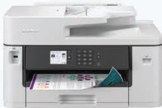
MFC-J3540DW | RM1,999