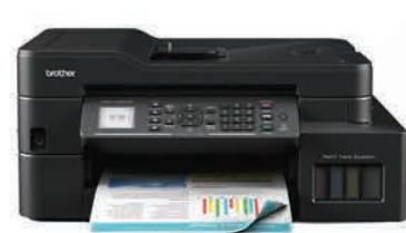
MFC-T920DW | RM1,149