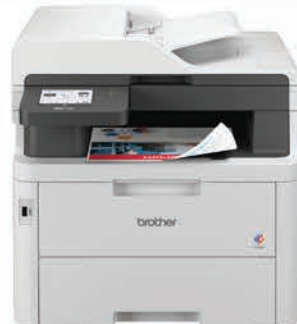
DCP-L3560CDW | RM1,999