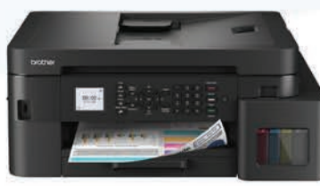
MFC-T930DW | RM1,299