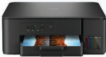
DCP-T230 | RM 549