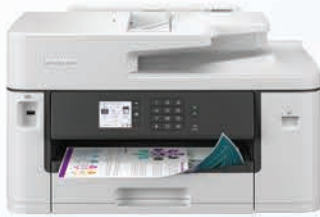
MFC-J2340DW | RM1,099