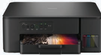
DCP-T430W | RM639