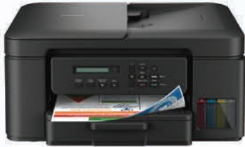
DCP-T730DW | RM929