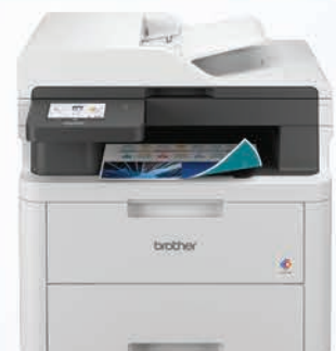
MFC-L3760CDW | RM2,249