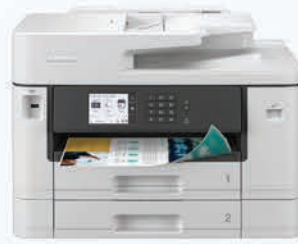
MFC-J2740DW | RM1,399