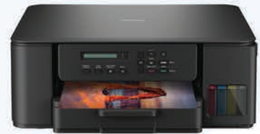
DCP-T530DW | RM749