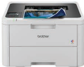
HL-L3240CDW | RM1,249