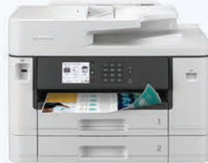
MFC-J3940DW | RM2,399